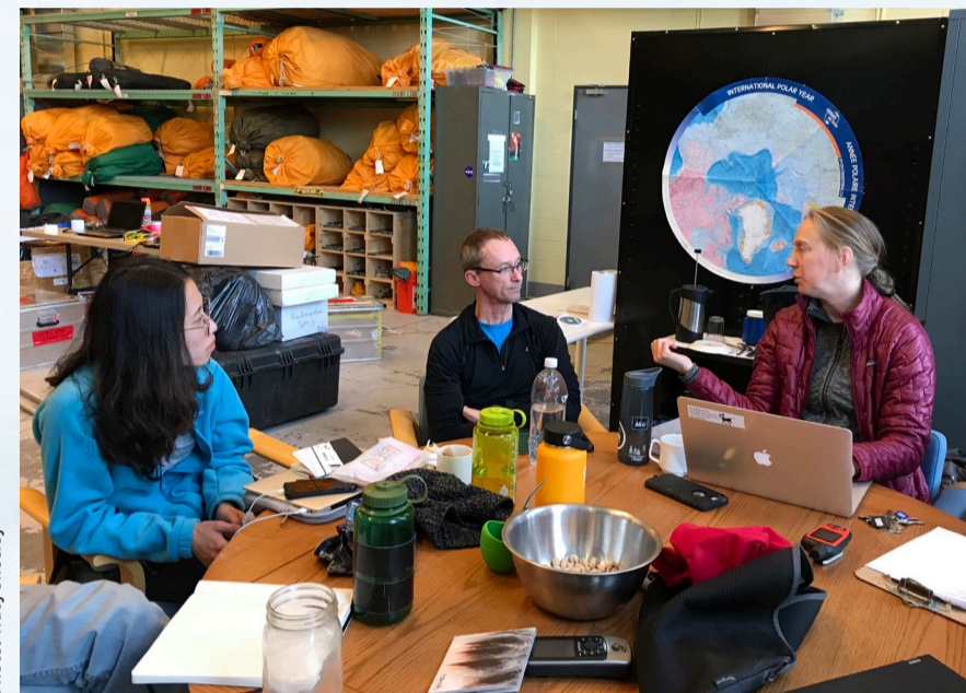
Meeting of the Rutgers Firn Core Team to discuss the fieldwork code of conduct before setting off to the field site outside of Kangerlussuaq, Greenland

The workshop brought up stories and experiences that are often unspoken and dismissed in the polar research community as a whole. What emerged were both shortcomings of current practices and pathways to producing equitable and inclusive polar science.