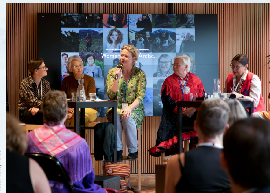
Women of the Arctic meeting in Helsinki 2018