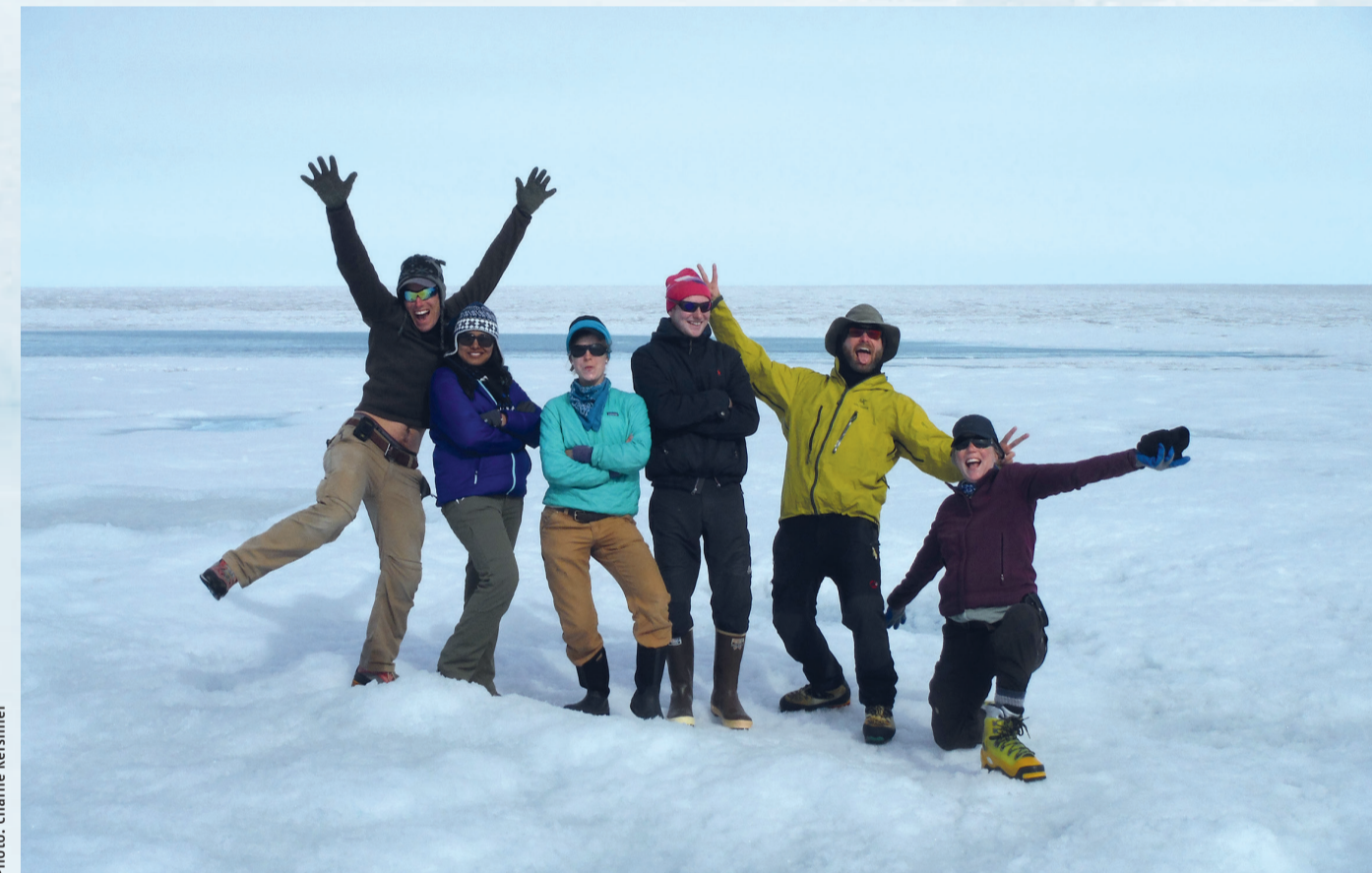
The Rutgers and UCLA Arctic Hydroclimatology Team celebrating successful fieldwork at the Rio Behar supraglacial river in southwest Greenland